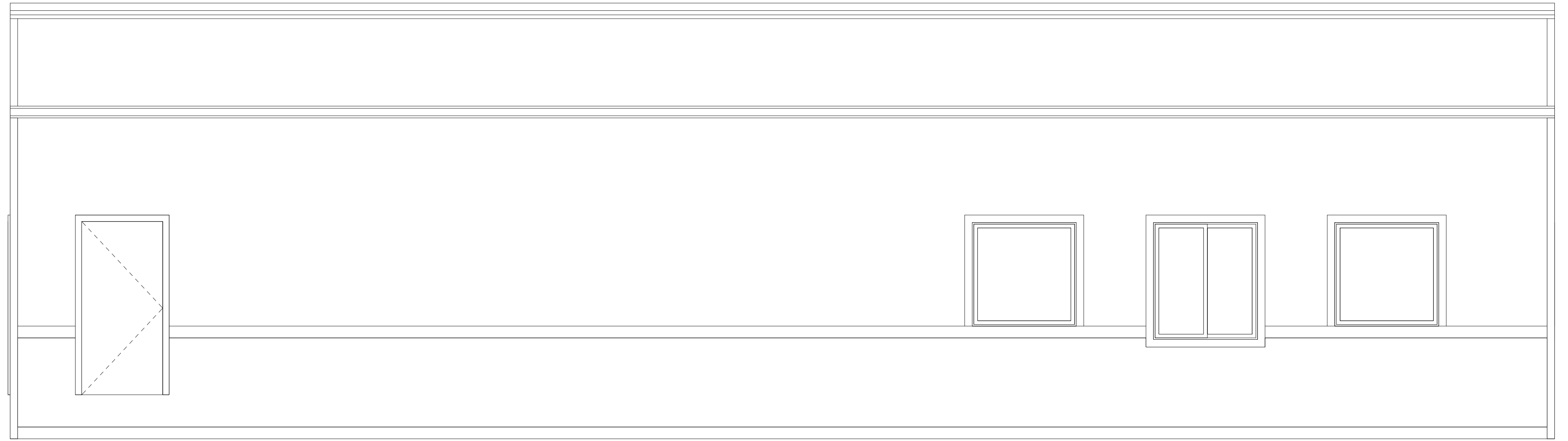
② North Elevation 3/8" = 1'-0"