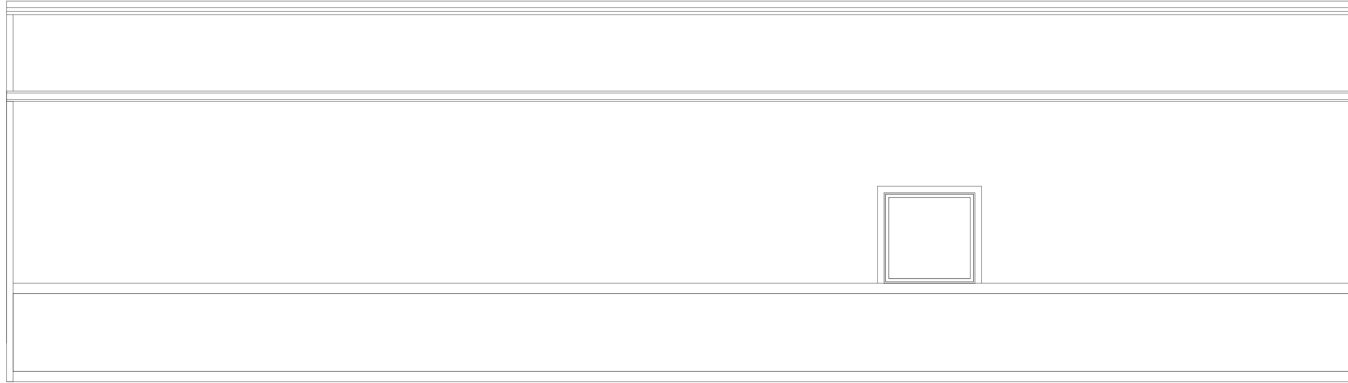
③ South Elevation 3/8" = 1'-0"